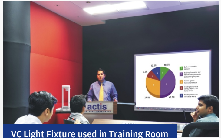
VC Light Fixture used in Training Room