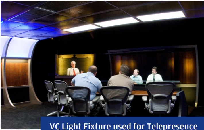
VC Light Fixture used for Telepresence